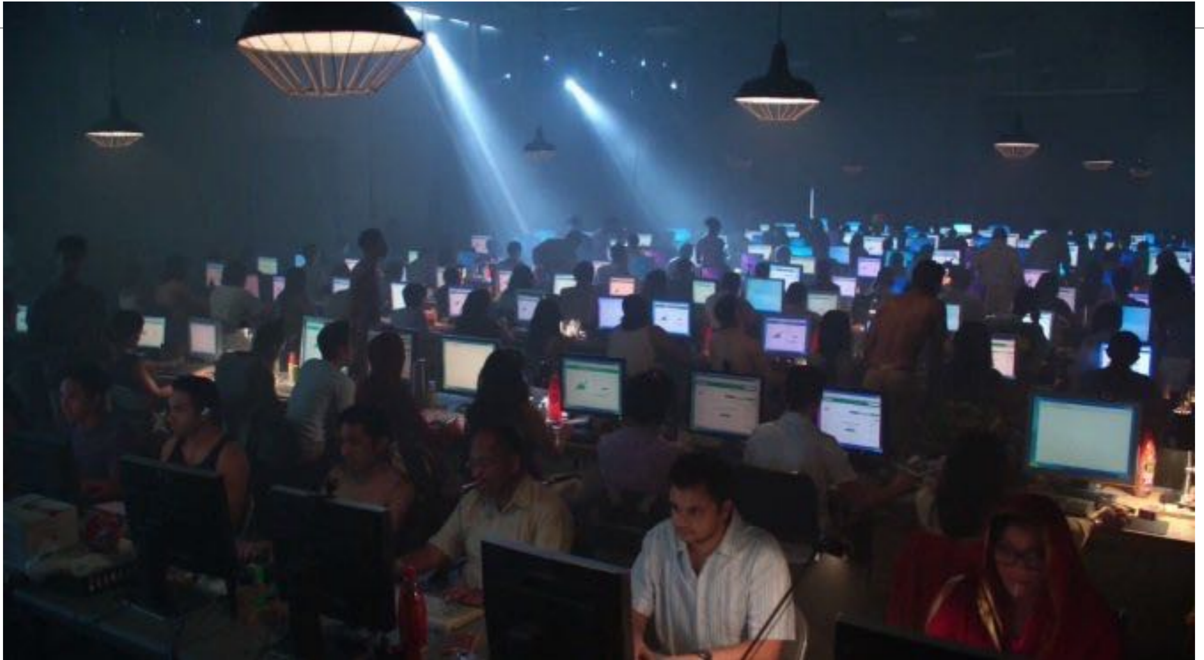
A still from HBO's Silicon Valley depicting a click farm